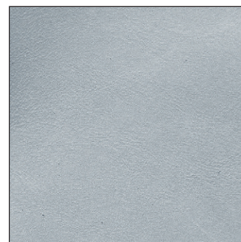
SUP/NBK GRIGIO PERLA