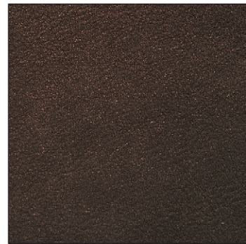
SUP/NBK MARRONE SCURO